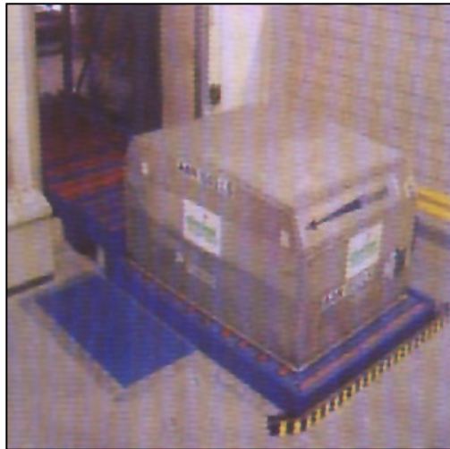
Scissors Lift Equipment