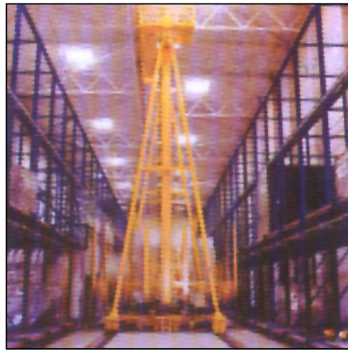
Elevating Transfer Vehicles( ETV'S)