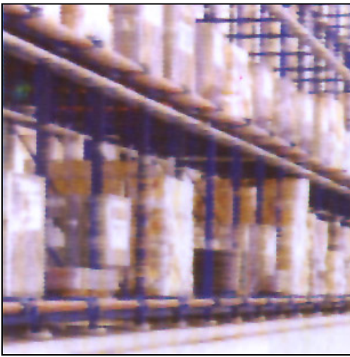
Transfer Vechiles(Tv's)and Shuttles