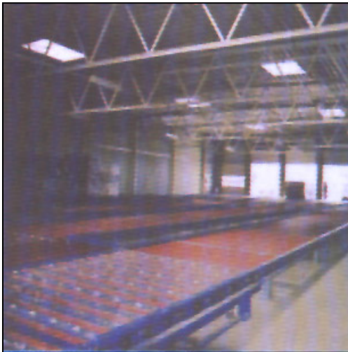
Powered Roller Conveyor Systems