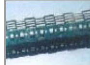
POSOTIVE INFINITIVE VARIABLE CHAIN- ROLLER TYPE