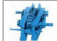
POSOTIVE INFINITIVE VARIABLE GEARBOX BASIC