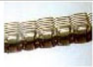
POSOTIVE INFINITIVE VARIABLE CHAIN -LINK TYPE

Home | CompanyProfile | Products | Enquiry | SiteMap | Download | Contact Us