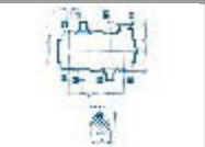
POSOTIVE INFINITIVE VARIABLE GEARBOX HORIZONTAL TYPE-U