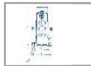
POSOTIVE INFINITIVE VARIABLE GEARBOX VERTICAL TYPE-U