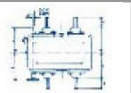
POSOTIVE INFINITIVE VARIABLE GEARBOX HORIZONTAL TYPE-A