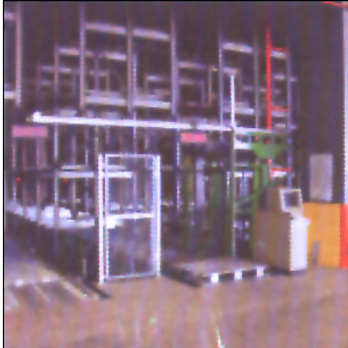
The ASRS with transport Units